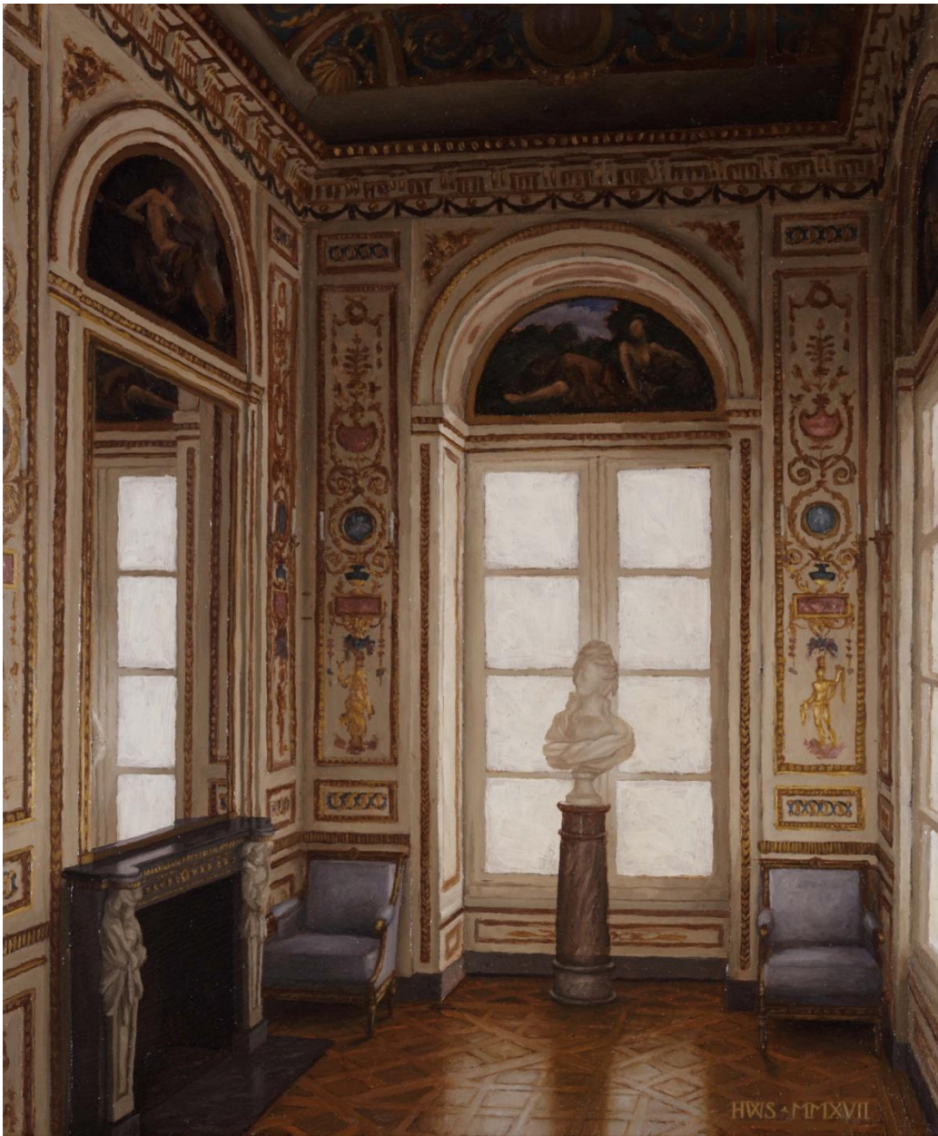
Sérilly Cabinet , oil on board, 12 x 10ins (30.5 x 25.4cm), by Harry Steen

press@jonathancooper.co.uk | +44 (0)20 7351 0410